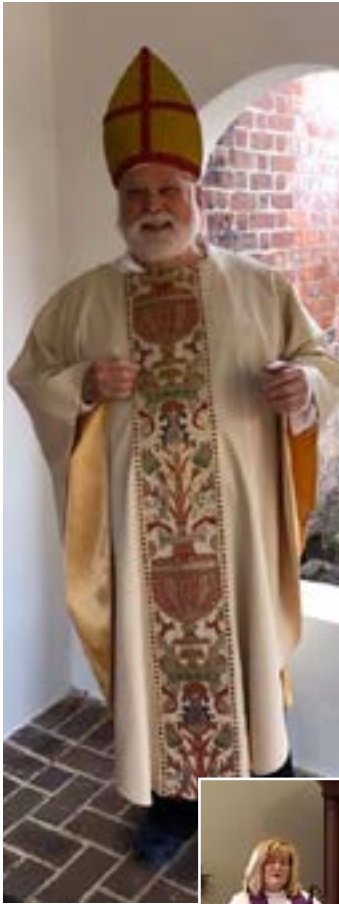
Sunday, December 8: Saint Nick came to visit ...