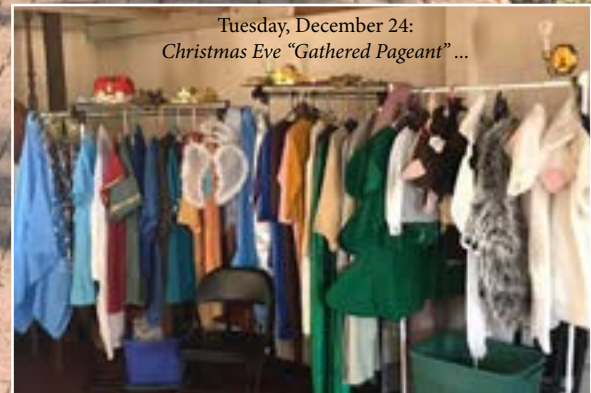
Tuesday, December 24: Christmas Eve "Gathered Pageant" ...