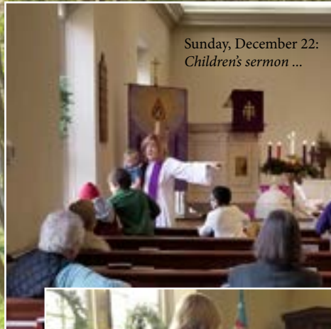
Sunday, December 22: Children's sermon ...