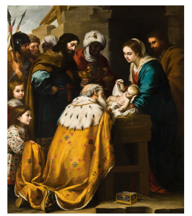
Adoration of the Magi by Bartolomé Esteban Murillo, 17th century

The reference to "readings" suggests that the Basilides were reading the Gospels. In ancient gospel manuscripts, the text is arranged to indicate