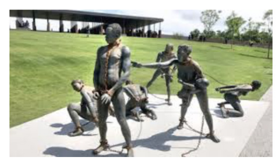
Copyright © 2018 DC Chapter Union of Black Episcopalians, All rights reserved. Interested in thriving congregations in the Diocese of Washington