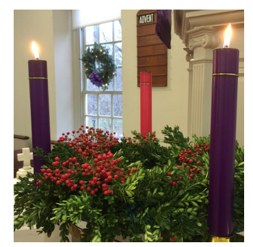
"Home for the Holidays" continued on next page...