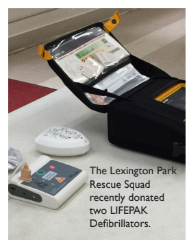
The Lexington Park Rescue Squad recently donated two LIFEPAK Defibrillators.