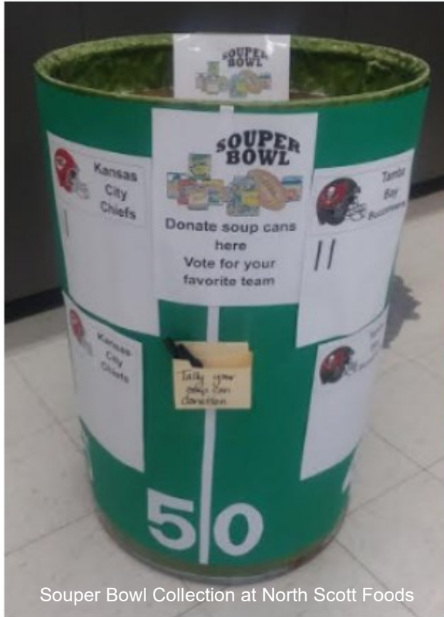
Souper Bowl Collection at North Scott Foods