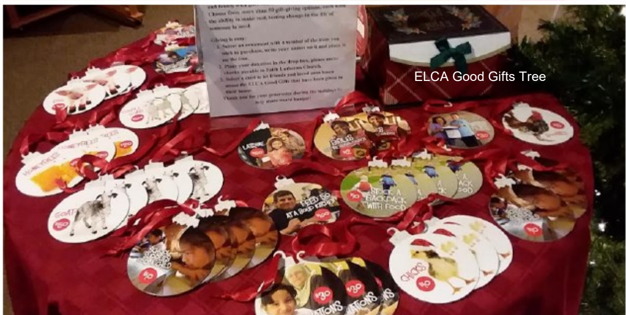
ELCA Good Gifts Tree