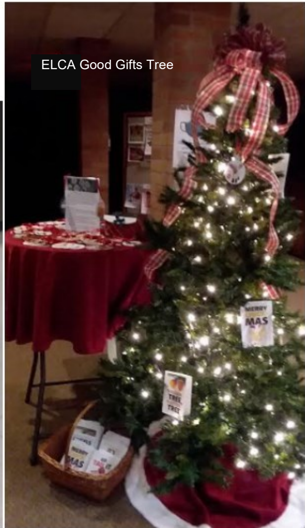
ELCA Good Gifts Tree