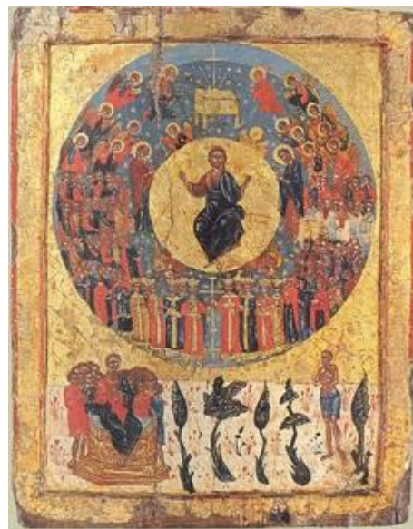
Greek icon of saints and angels around Christ's throne. (c. 1700)

This Sunday, November 3, we celebrate All Saints' Sunday , a day to rejoice and give thanks for all those through the ages who have faithfully served the Lord, those faithful men, women, and children who, even now, help others to love and serve God. In our Presbyterian and Reformed tradition, rather than putting saints on pedestals as holy people set apart in glory, we give glory to God for the ordinary, holy lives of the believers of this and every age. As we share in The Lord's Supper, we will speak the names of those saints we have known, and especially those who have died, and we will pray that we may be counted among the company of the faithful. I am always so moved with thanksgiving and gratitude as I hear those names lifted in prayer.