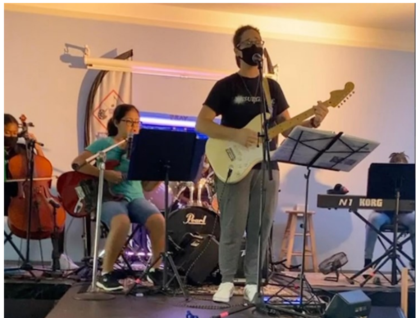
Youth Band and worship time with Activate