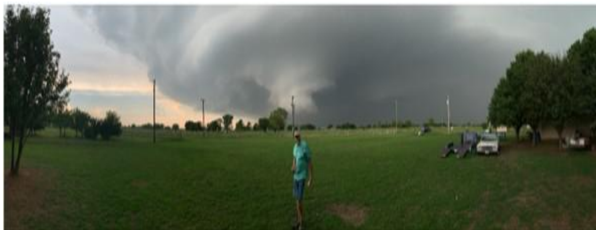
Tornado forming in north Texas – time to head for shelter!

We left Central Florida in mid-February, and got as far as east Texas by mid-March when the first Covid shutdown hit. All our plans fell like dominoes. The plan had been to spend two weeks crossing Texas. Instead, we spent two months sitting in east Texas where we endured not one but two tornadoes.