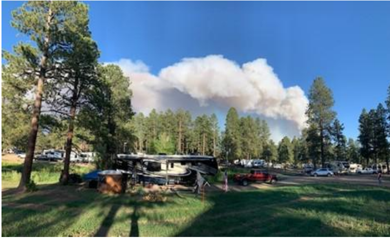
Smoke from Colorado wildfires about eight miles away

One more piece to the summer-of-fun was a broken tooth and an emergency trip to the dentist.