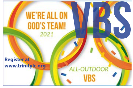
July 12-15, 6:30-8 pm on Trinity Green Space | Ages 4-9

Please drop your offering in the collection receptacle as you exit. Thank you!