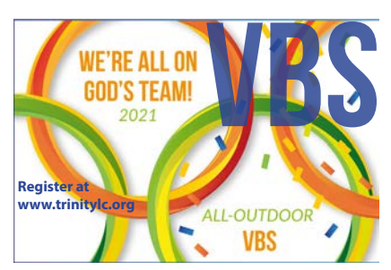
July 12-15, 6:30-8 pm on Trinity Green Space | Ages 4-9

SAFE WORSHIP RESTRICTIONS at https://trinitylc.org/worship-music/worship/drive-in-summer-worship/