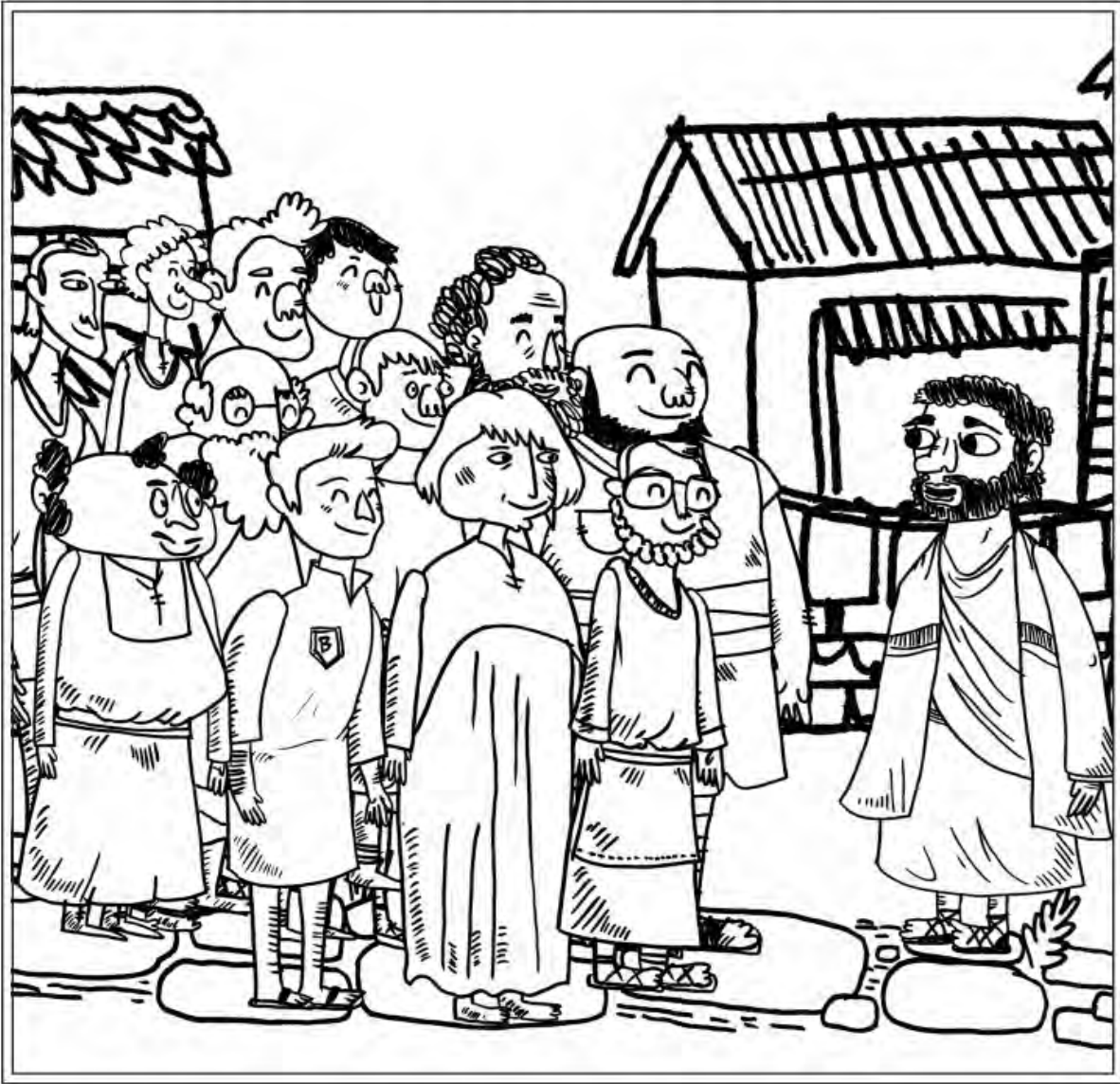
Jesus said, "Follow Me."