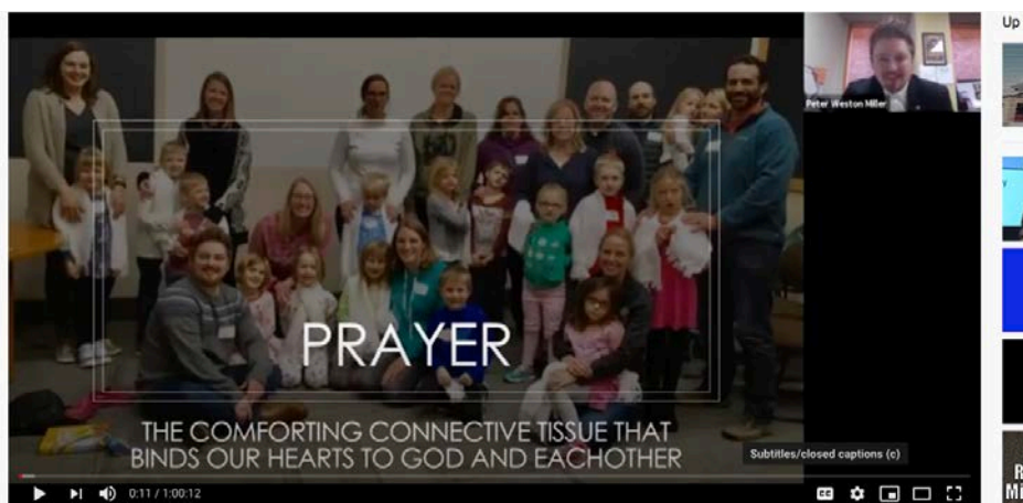
Prayer and Comfort - Adult Faith Forum Oct, 11 2020