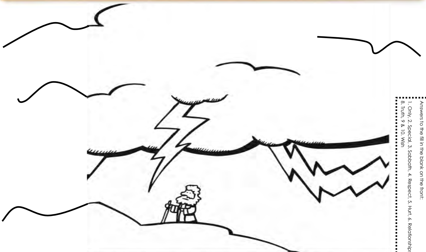
When Moses got to the top of the mountain, God spoke.

Answers to the fill in the blank on the front: 1. Only, 2. Special, 3. Sabbath, 4. Respect, 5. Hurt, 6. Relationships, 7. Take, 8. Truth, 9 & 10. Wish