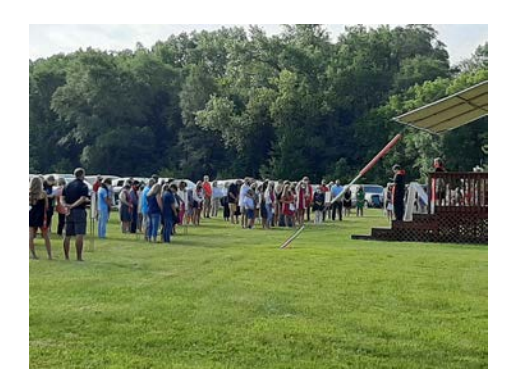
On Sunday, Aug. 23 we recognized last year's 9th grade confirmands with laying on of hands in physically-distanced family groups and honks of praise at drive-in worship.

Sunday Sept. 27 at 1 pm — High School Ministry gathering at Drive-in Sunday Oct. 25 at 1 pm — High School Ministry gathering at Drive-in