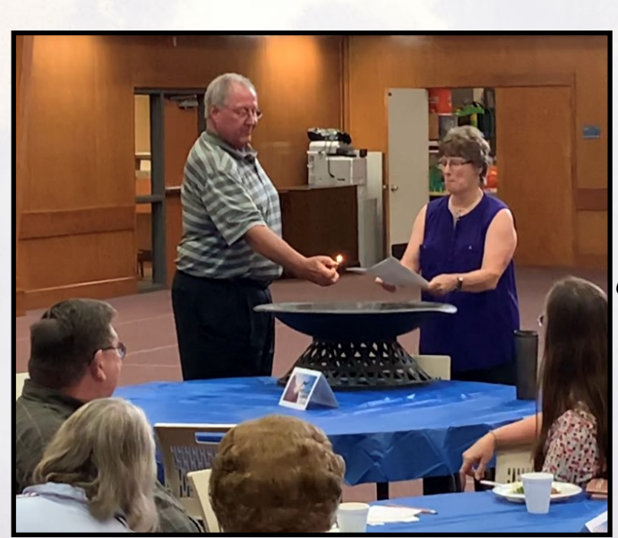
Construction Loan Note Burning Sunday, June 23

First Milestone Celebration Received $250,000 in funds and paid off the construction loan!