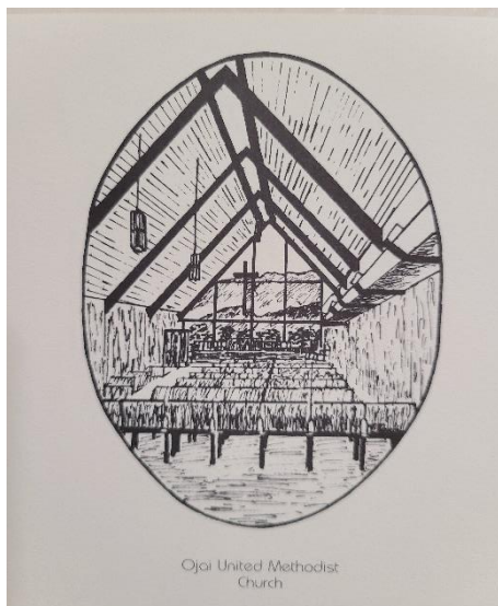
Ojai United Methodist Church